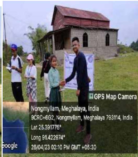
GPS Map Camera Nongmyllam, Meghalaya, India 9CRC+6G2, Nongmyllam, Meghalaya 793114, India Lat 25.391775° Long 91.422974° 26/04/23 02:10 PM GMT +05:30