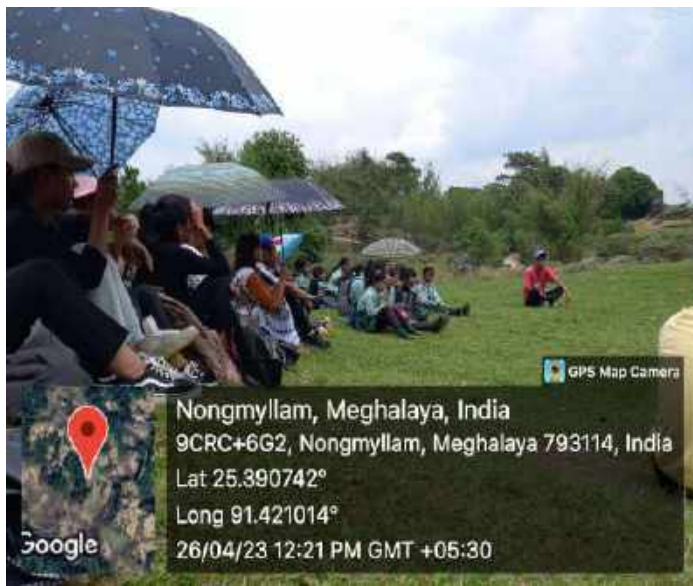
GPS Map Camera Nongmyllam, Meghalaya, India 9CRC+6G2, Nongmyllam, Meghalaya 793114, India Lat 25.390742° Long 91.421014° 26/04/23 12:21 PM GMT +05:30