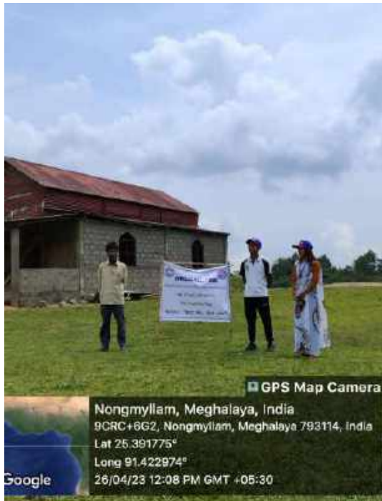
GPS Map Camera Nongmyllam, Meghalaya, India 9CRC+6G2, Nongmyllam, Meghalaya 793114, India Lat 25.391775° Long 91.422974° 26/04/23 12:08 PM GMT +05:30