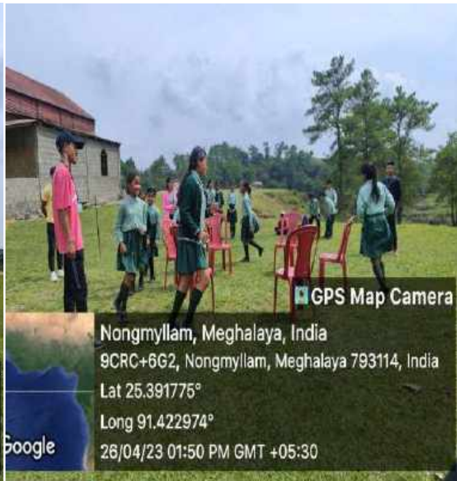
GPS Map Camera Nongmyllam, Meghalaya, India 9CRC+6G2, Nongmyllam, Meghalaya 793114, India Lat 25.391775° Long 91.422974° 26/04/23 01:50 PM GMT +05:30